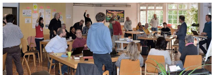
Speaking to the other ECMI leaders in Germany in December

One ministry that has been going on for many years is the support of a Christian school in India by the children of the Sunday School. In December there was the annual fund raising event, in which the children prepared hot dogs, waffles, coffee, and Christmas cards for the monthly church lunch, for which people gave an offering. The support took a step up recently, when in January one of the young ladies in the church went to India to visit the school. She came back with great stories and an encouragement for the children and the church to continue. We pray that the missionary outlook will continue in all of them for the rest of their life.