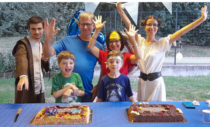
And the party had a science fiction theme. Can't do better than that!